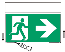
Replace indicator board